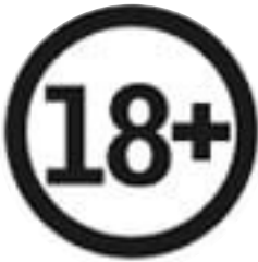
suitable for eighteen and over