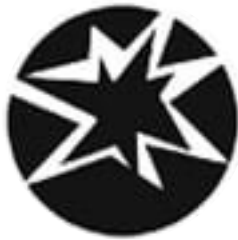
violence / horror