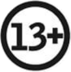
suitable for thirteen and over