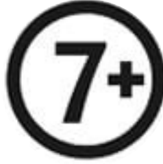
suitable for seven and over